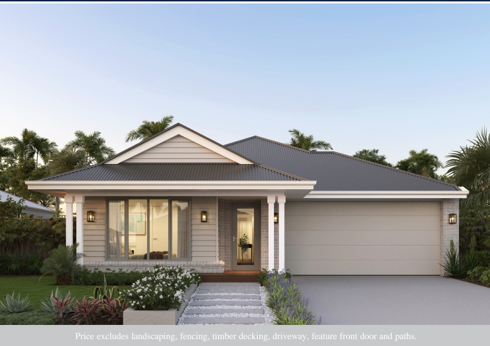
Price excludes landscaping, fencing, timber decking, driveway, feature front door and paths.