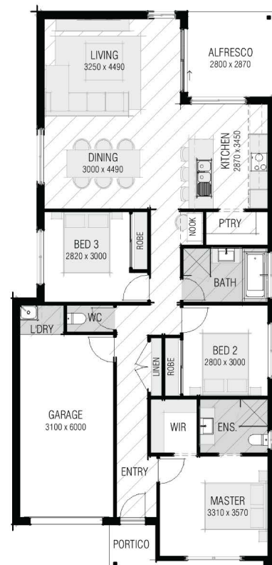
Bowen 145 FLOOR PLAN

All information is correct at the time of publishing. Advertised price, facade and inclusions are an example to suit the advertised lot and are to be confirmed upon consultation with a DC Living New Home Consultant. Photos are used for illustrative purposes only and plans, finishes, facades and inclusions may differ from what is shown or may represent optional items at an extra cost. Plans, finishes, facades and inclusions may differ for display homes. Pricing does not include legal fees or stamp duty on land. Land price and availability as subject to change. Land is not supplied by DC Living and may be subject to developer terms and conditions. *Guaranteed time frames applicable to registered land in Greenfield Estates only. Build time frame commences at base claim stage.