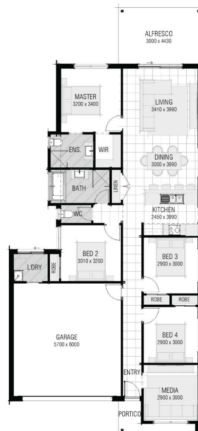
Cooper 180 FLOOR PLAN

3 weeks to contract 12 weeks to site 20 weeks to build